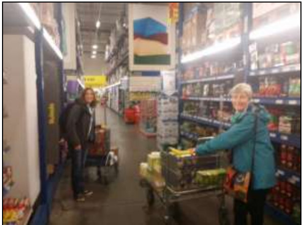
Shopping for contents of food parcels.

A group of packer volunteers were in Romania from December 2<sup>nd</sup>-9<sup>th</sup> Students from Beaulieu Convent School were there from Dec 10<sup>th</sup>-13th