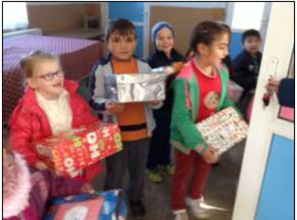
Most of the children took their shoeboxes home to open at home.