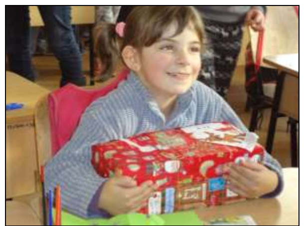
Clutching her shoebox tightly.