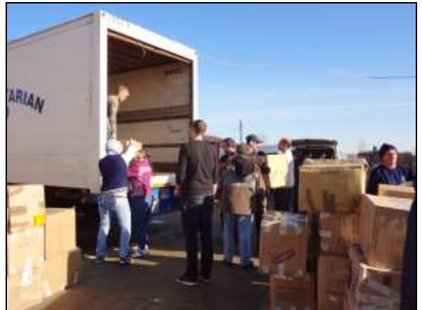
Unloading the aid trailer, including medical equipment from Jersey for Oradea hospital.