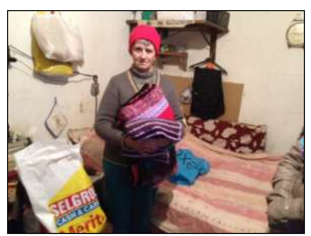
Distributing blankets to those in need - <u>THANK YOU TO</u> <u>ALL OUR KNITTERS</u>