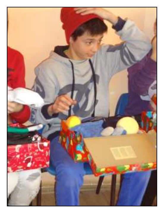
The hat seems to fit all right!