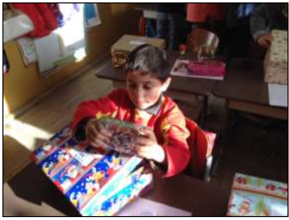
Seeing the joy (sometimes amazement) on the children's faces made it so worthwhile.

Mustard Seed Jersey Dec 14/ Jan 15 Page 2