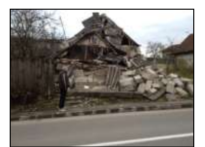
The demolished house, where they had lived, free of charge.

Of course £11,000 means we can assist more families in dire need of accommodation. Watch the media for details".