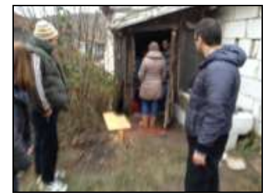
The tiny freezing leaking shed where they lived after the accident.