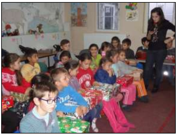
Shoeboxes given to children in Mustard Seed's homework club.