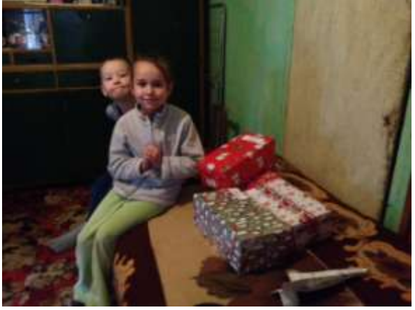
Most shoebox distribution was in schools, but a few were taken to children's homes.