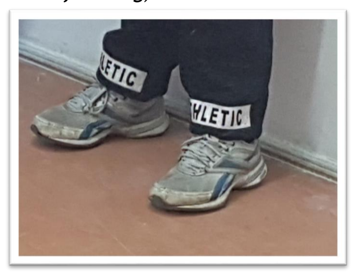
After the SHOES, the school's next priority request is that we should help them with SCHOOL TABLES AND CHAIRS (for children age 8 and over) and CRAFT MATERIALS.

This school has asked for our help, saying that their priority need is WINTER-WEIGHT SHOES (many of the kids were in summer shoes in temperatures below freezing).