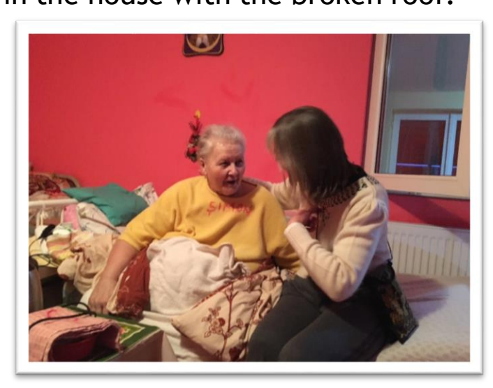
"Although we could not understand, we could tell they were glad we were there"