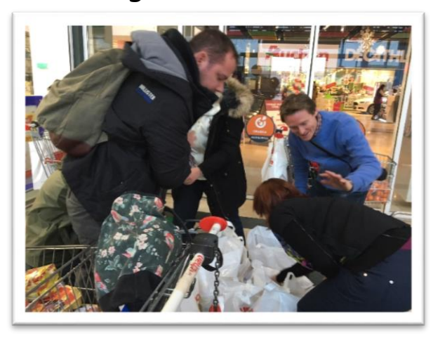
Buying the contents (5 trolleys full) then packing food parcels.