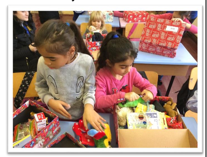
The boxes were beautifully covered. Thanks to those who covered the boxes so carefully.