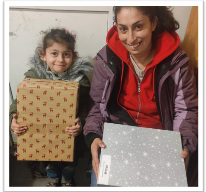
Helping whole families: Shoeboxes for impoverished mother and child