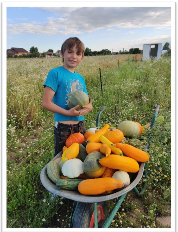
Helping to fund a project to provide vegetables and an income for the residents on our Changed Lives site