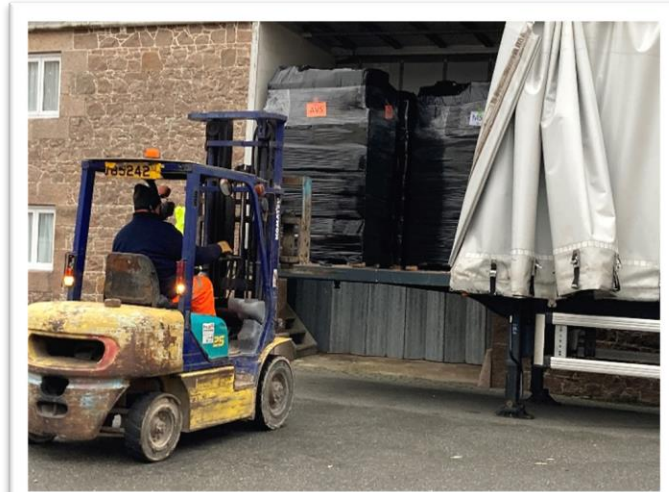
22 pallets of humanitarian aid, packed and loaded in Jersey ..... unloaded in Romania in December