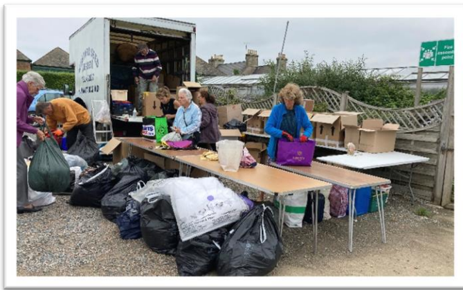
Relief aid collections at Holme Grown Farm Shop car-park