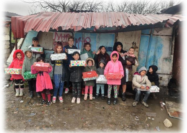
A desperately poor community

In Mustard Seed we give shoeboxes to needy adults as well as children.