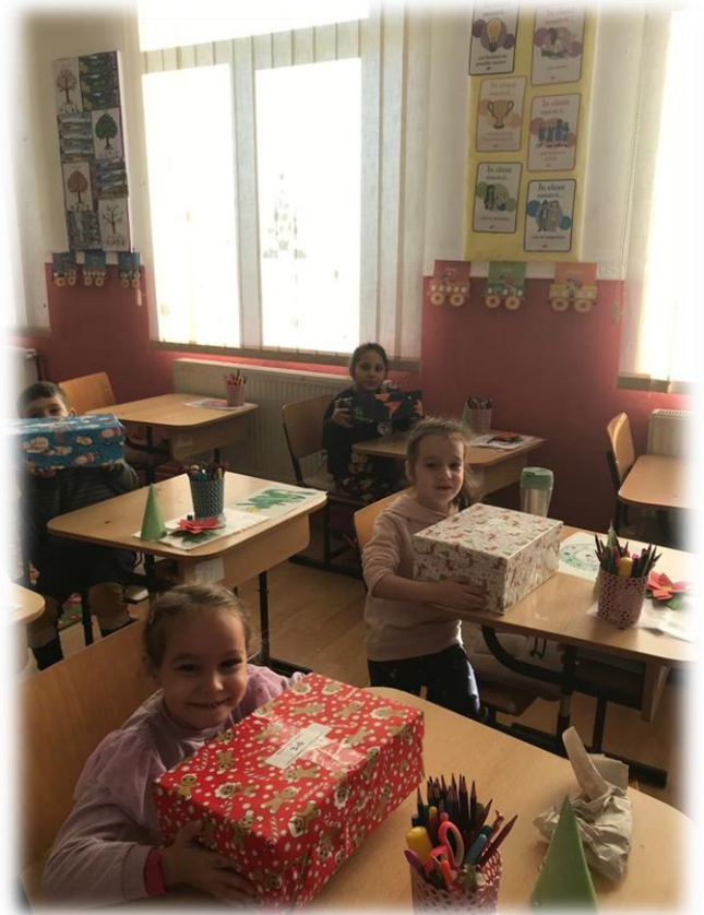
Distribution in one of the schools.

In 2022 we sent 3046 Christmas shoeboxes to Romania; approx. half were given to Ukrainians. THANK YOU TO ALL WHO GAVE