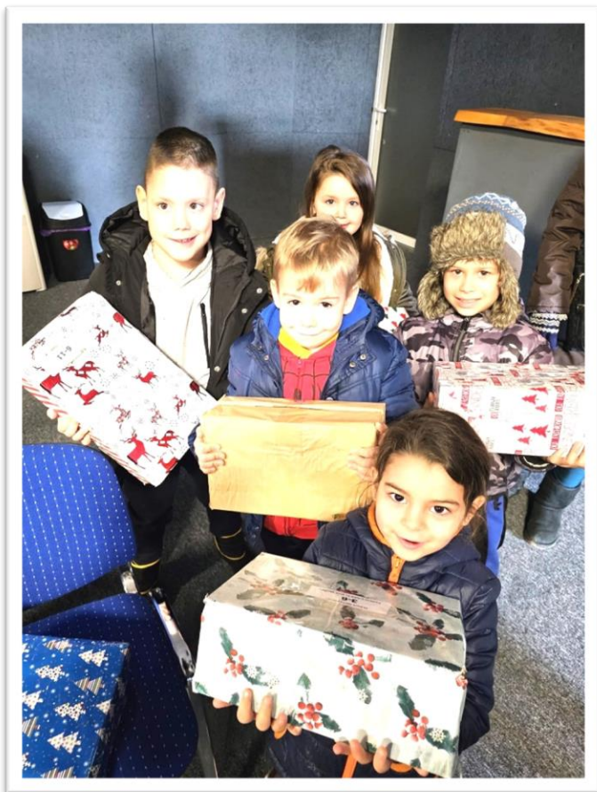
The smiles, looks of anticipation, and the concentration when opening the boxes say it all.