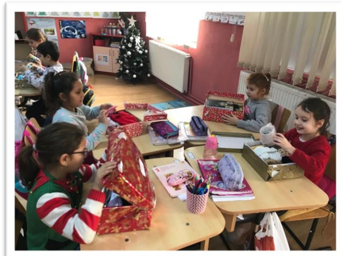
Of the 2150 shoeboxes sent to Romania, over 1600 were for children, with approx 500 for adults