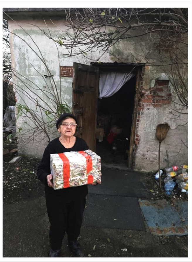
One of our sponsored pensioners receives a box (larger than a shoebox) packed by her sponsor.