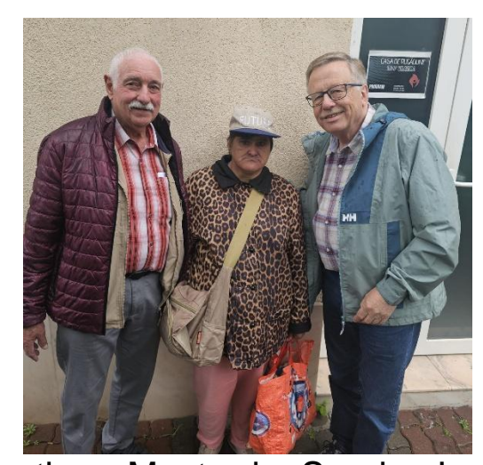
At the Mustard Seed Jersey breakfast in April funds were raised to purchase hearing aids for this lady & solar lighting for another.