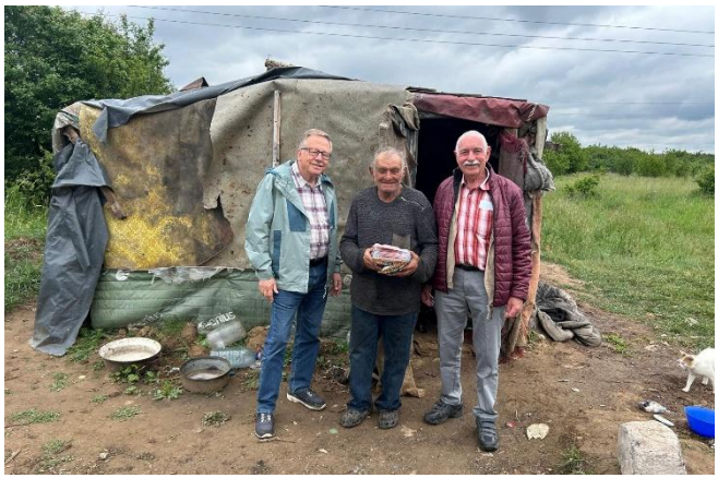
Visiting & giving food to people who live near the rubbish dump and scavenge for food to survive

With AVS they visited families and children living in appalling conditions. The children in this photograph all benefit from the homework club that is run by AVS volunteers. (This visit was especially meaningful to Ron as his church assists this homework club).