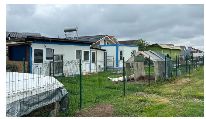
The Changed Lives site: here portercabins and 2 refurbished Mustard Seed aid trailers provide accommodation for the homeless