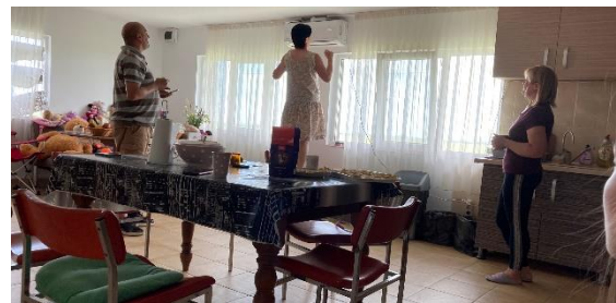
Above: inside Casa CarolAnn. Below: the new playground at Casa Rabi, generously paid for by Jersey.